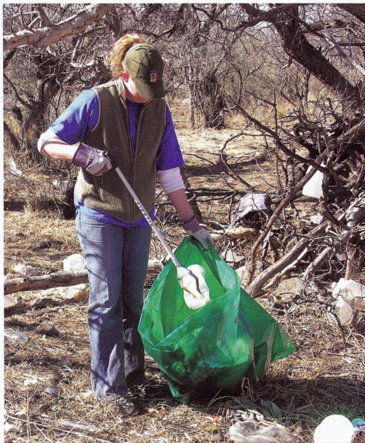
The illegal immigration problem also extends out to our deserts, where habitats are destroyed by trash.

A handful of Tucson bowhunters started a group called Arizona Hunters Who Care that organizes trash cleanups in the deserts south of Tucson. My wife and I joined them for a cleanup, and with donated gloves, trash bags, and long-handled trash grabbers, we set out to fill our bags. It didn't take long to find a trail with some scattered water bottles. After following it up and over a hill, we discovered a typical lay-up area where the illegals stopped to rest, refresh, and change clothes. Water bottles, food